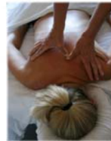
Our professional staff makes sure you get great service