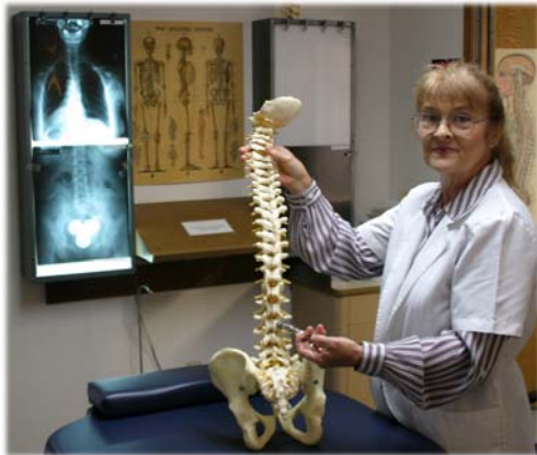
Precision adjustments with safety and comfort